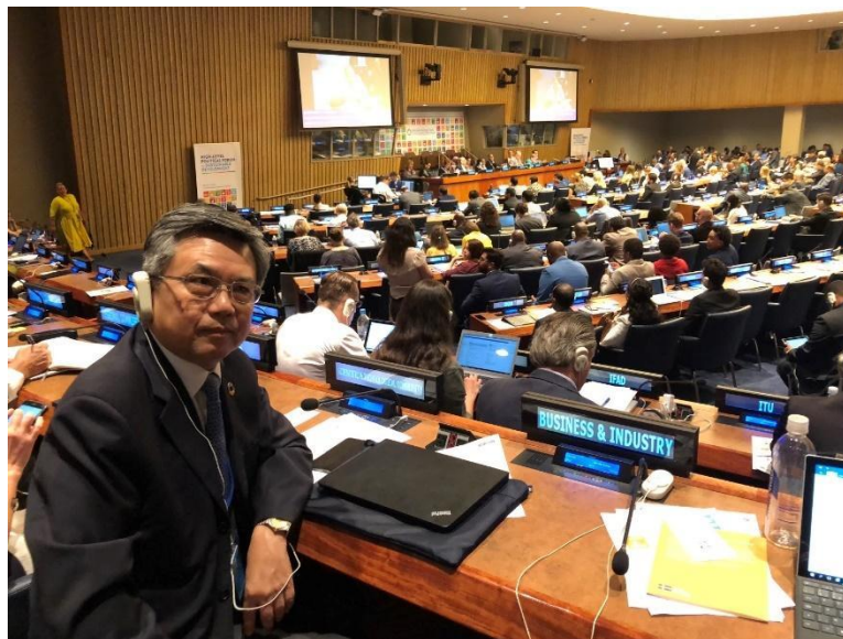
WFEO President Elect at Plenary Session on Goal 7

with numerous parallel side events from 1315 through 2000 hrs. The WFEO side event STC for Sustainable and Resilient Societies 6:30 to 8:00