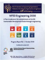
WFEO Engineering 2030 Plan