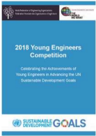
2018 Young Engineers Competition