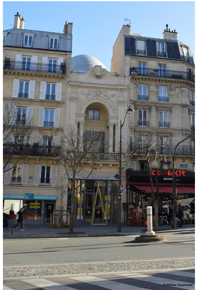
PYRAMIDION, born in a building by Renzo Piano with a facade of Rodin (above), has moved to the blue heart of the Town Hall of the 13 th arr., Paris.