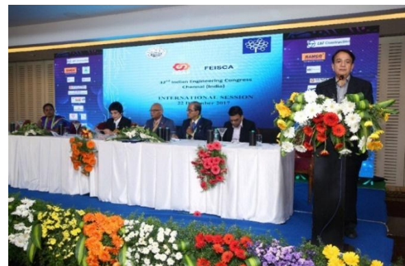
Chair WFEO-CIC delivering his address