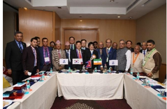
The International Meet