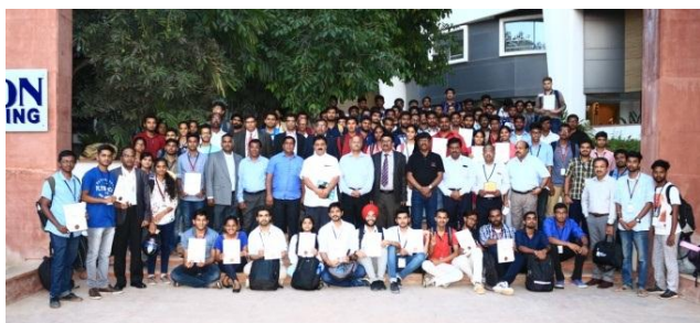
Team of AgRuTech 2018