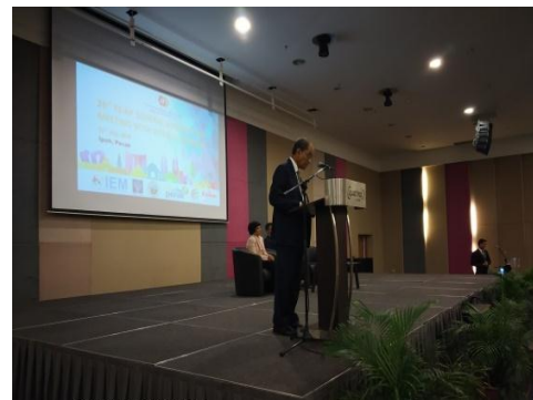
President IEI addressing the audience