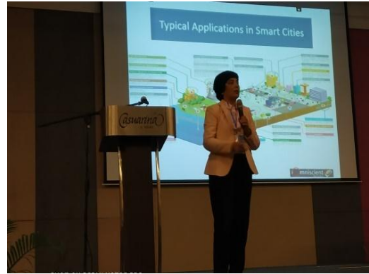
WFEO President delivered his talk on Smart cities for sustainable development