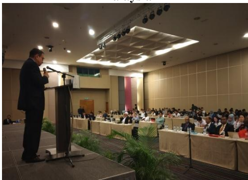
Vice President WFEO addressing the audience