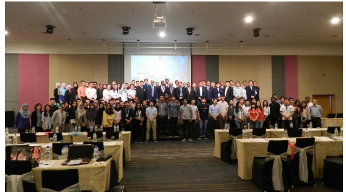
Students at WFEO-CIC International Seminar at Ipoh, Malaysia