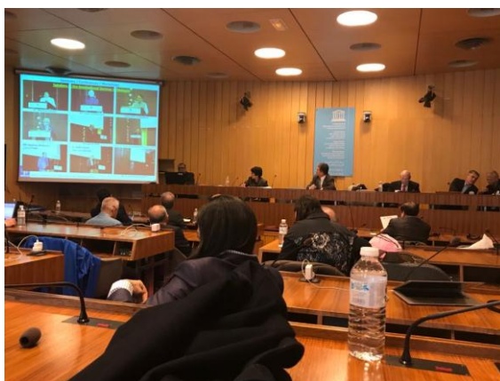
WFEO Executive Board meetings at Paris