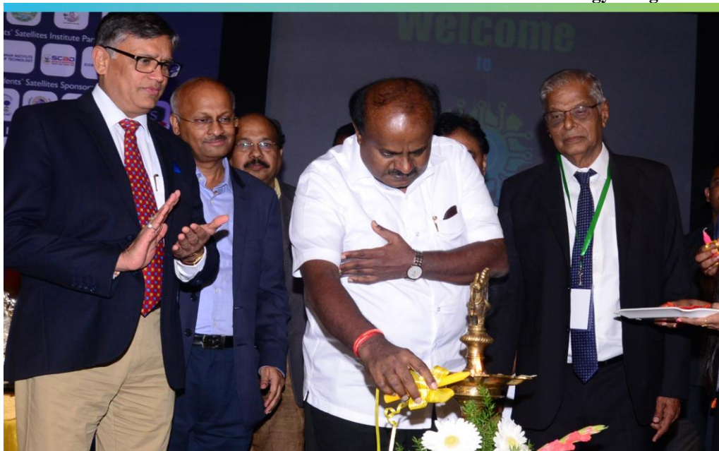
Hon'ble Chief Minister inaugurating the ITC-2018