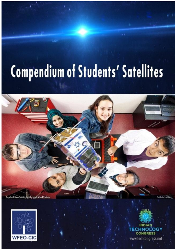
Coverage of Publication