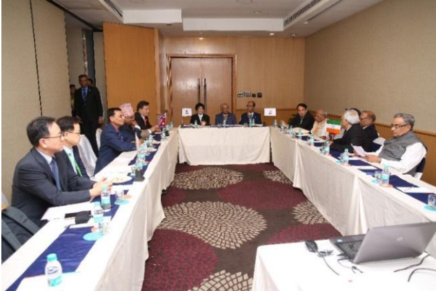
The International Meet in progress