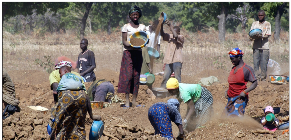
Artisanal and small-scale mining, as pictured in Burkina Faso, Africa, employs ten times more people than large-scale mining, and provides jobs and income for 20-30 million of the world's poorest people.

The TF engages in a range of activities that generally fall into one of two broad categories: (1) Technology and Best Practices Transfer and (2) Capacity Building. These activities take many forms including articles, symposia, short courses, workshops, expert panels, and/or conferences on minerals