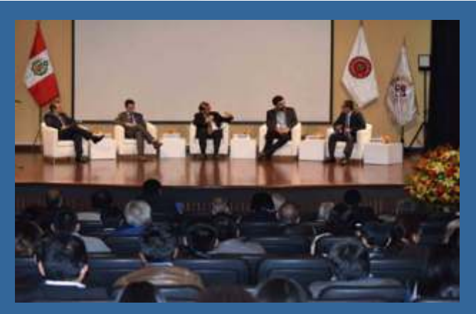
The speakers and their constructive discussions with the audience