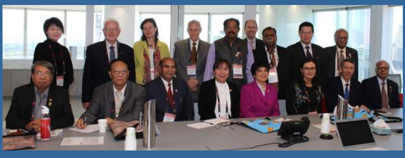
Annual face-to-face meeting for WFEO-CDRM, Australia 2019

The annual face-to-face meeting for WFEO-CDRM was held at the Engineers Australia's headquarters, Melbourne, Australia on Monday, November 18, 2019. The participants were engaged in many valuable discussions related mainly to the mission of the committee and projected activities 2020. The highlights of the meeting were: