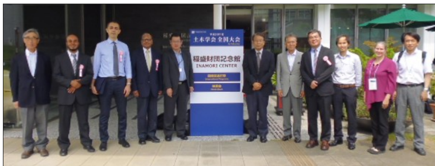
Guest speakers and organizing committee's members