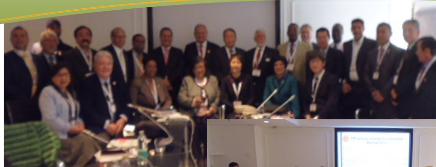
Photos in the #8 face-to-face meeting of WFEO-CDRM in Rome (Italy), on November 27, 2017