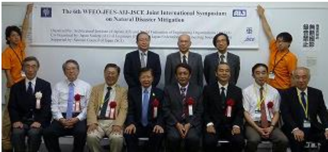
Lecturers and Concerned Parties of the Symposium

The host organization, Architectural Institute of Japan acknowledged the positive results gained from active exchange of opinions by a large number of participants, despite the fact that the whole program including lectures and question-and-answer sessions were provided in English without interpretation.