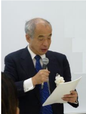
Opening address by AIJ President