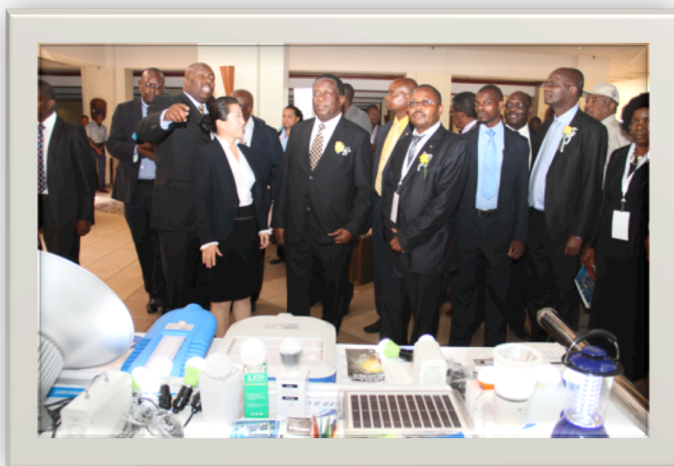
The Vice President of the Republic of Zimbabwe, Hon. E D Mnangagwa (centre) accompanied by two Ministers Professor Moyo of Higher and Tertiary Education, Science and Technology Development and Hon. S Kasukuwere of Local Government, Public Works and National Housing and delegates of the UNESCO Africa Engineering Week at the Elephant Hills Resort, Victoria Falls, Zimbabwe.