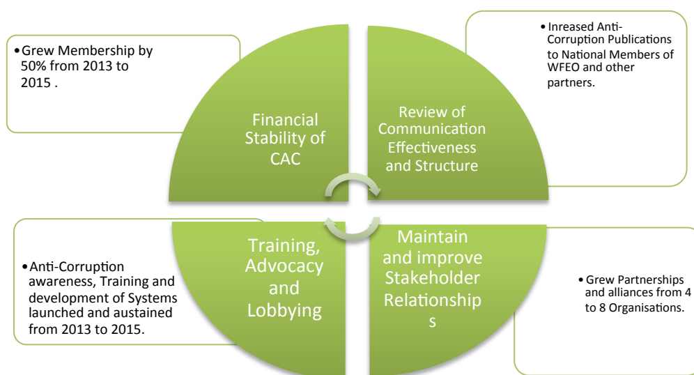
Figure 1: Key Milestones 2013-2015

We have learnt a lot of lessons on how to handle apathy by National Members one key one being that we must always ensure there are Ethics and Transparency Workshops and Presentations at every National Member's Annual Event or Conference. Our overall framework of strategic monitoring and evaluation will be based on the criteria given below.