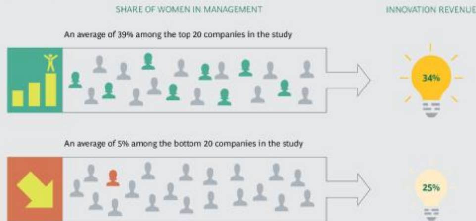
EXHIBIT 5 | Innovation Increases as the Proportion of Female Managers Rises

Source: 2016 survey of 171 German, Swiss, and Austrian companies by BCG and Technical University of Munich. Note: Innovation revenue = the percentage of revenue from new products or services in the most recent three-year period.