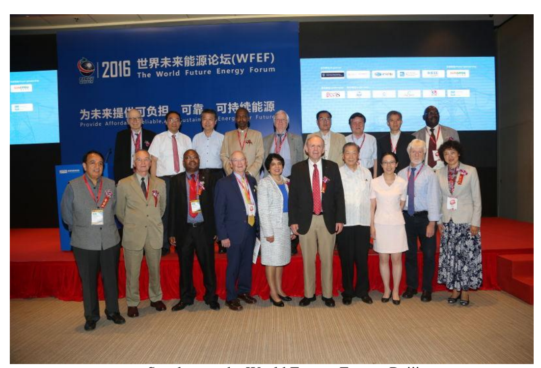
Speakers at the World Energy Forum, Beijing

The World Future Energy Forum was an important opportunity to share knowledge and ideas on sustainable energy. The topics were greatly appreciated by the enthusiastic delegates.