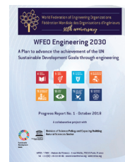
WFEO Engineering 2030 Plan