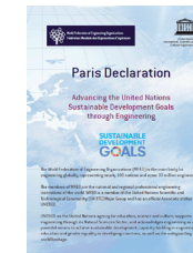
The 2018 Paris Declaration