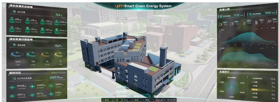
Figure 3. Comprehensive Energy Management and Control System