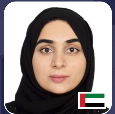
MAHGANJ DURRA, UNITED ARAB EMIRATES (ARAB)

Topic: Empowering the Next Generation of Engineers Through Artificial Intelligence and Data Analytics