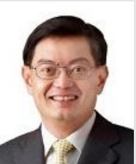
Mr Heng Swee Keat (Minister for Education, Singapore)