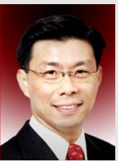
Mr Lee Yi Shyan (Senior Minister of State, Ministry of Trade and Industry and Ministry of National Development, Singapore)