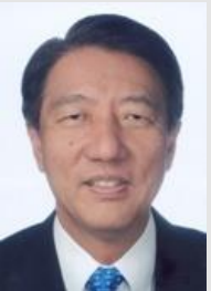
Mr Teo Chee Hean (Deputy Prime Minister, Coordinating Minister for National Security and Minister for Home Affairs, Singapore)