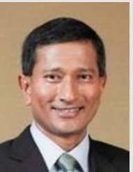
Dr Vivian Balakrishnan (Minister for the Environment and Water Resources, Singapore)