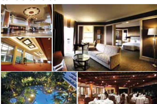
Hotel Equatorial Penang

Jalan Bukit Jambul, 11900 Penang T: +60 4 632 7000 F: +60 4 632 7100 E: info@pen.equatorial.com W: www.hotel-equatorial-penang.com