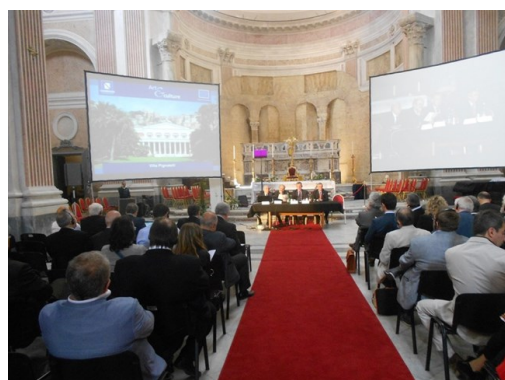
Conference "Artistic and Monumental Heritage – Restoration, Safeguard and Enhancement" at Basilica di San Giovanni Maggiore a Pignatelli