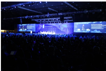
European Economic Congress

missioner Juncker's plan involve both research projects and construction projects with the participation of civil engineers (with varying levels of responsibility). This will surely offer an opportunity to gain new experience, skills, the challenge lying in the shared responsibility for the modernization of the economic infrastructure. It is civil engineers who will be responsible