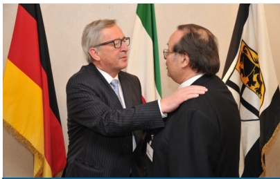
Jean - Claude Juncker and Vassilis Economopoulos