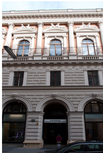
Façade of the ASEA Headquarters