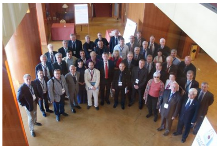
Group photo of the 62 nd ECCE General Meeting participants

The 61 st ECCE General Meeting – 30 th ECCE Anniversary has finished successfully. It was held on 29 th – 30 th May 2015, in Naples, Italy hosted by the National Council of Italian Engineers (CNI).