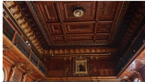
Detail of the ceiling in ASEA Headquarters