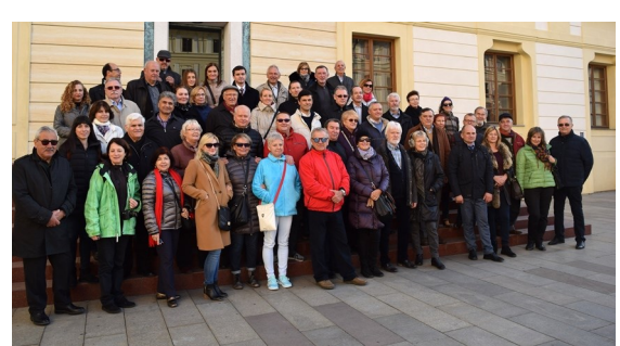
Group photo of the 62<sup>nd</sup> ECCE General Meeting participants

2015, in Prague, in Czech Republic, hosted by the Czech Chamber of Certified Engineers and Technicians (CKAIT). The 62<sup>nd</sup> ECCE General Meeting consisted of three parts. The first one was a short workshop that took place on Friday 30<sup>th</sup> October at the University Centre for Energy Efficient Buildings (<u>UCEEB</u>) organized by the hosts, then it was the regular General Meeting of ECCE and the third part was the celebration of the 150<sup>th</sup> Anniversary of the founding of "the Society of Architects and Engineers of the Kingdom of Bohemia (SIA)" that took place on 31<sup>st</sup> October at the Bethlehem