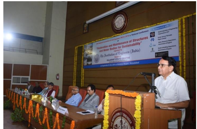
Chair WFEO-CIC delivering his address