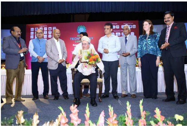
Dignitaries in ITC-2019