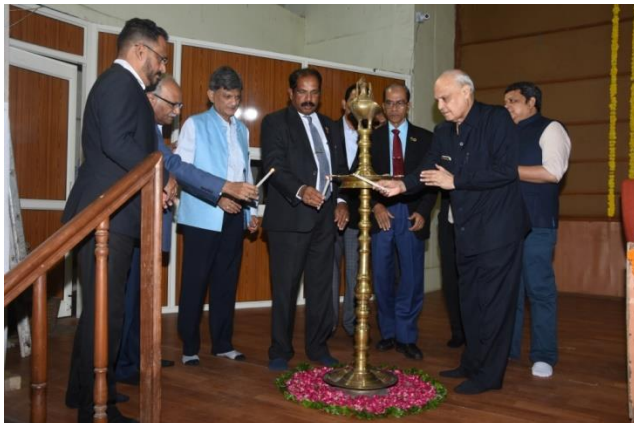
Inaugural session of the event