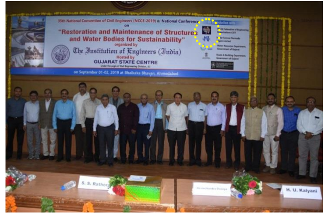
Group photo of the dignitaries at the end of event