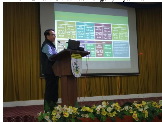
Vice President WFEO addressing the audience and delivered his talk on “Smart cities – Present Scenario and Future Development”