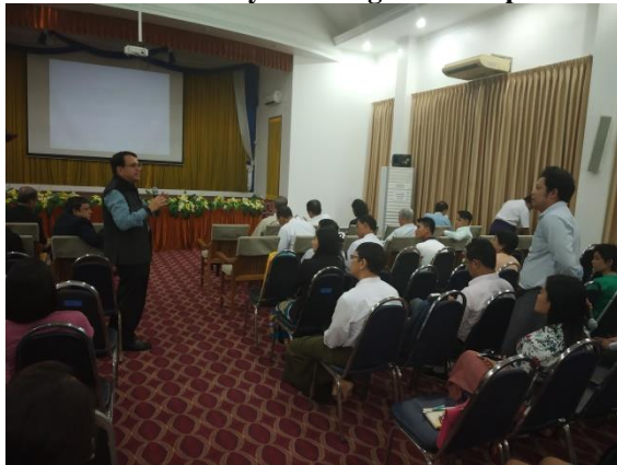
Question and Answer session after presentation