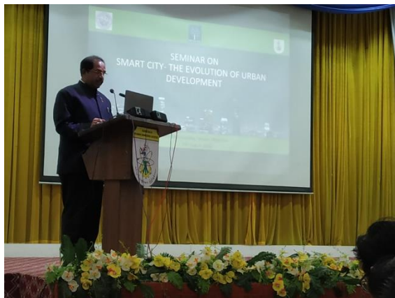
President IEI addressing the audience