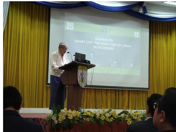
Vice President Myanmar Engineering Society addressing the audience at International Seminar on “Smart Cities” at Yangon, Myanmar