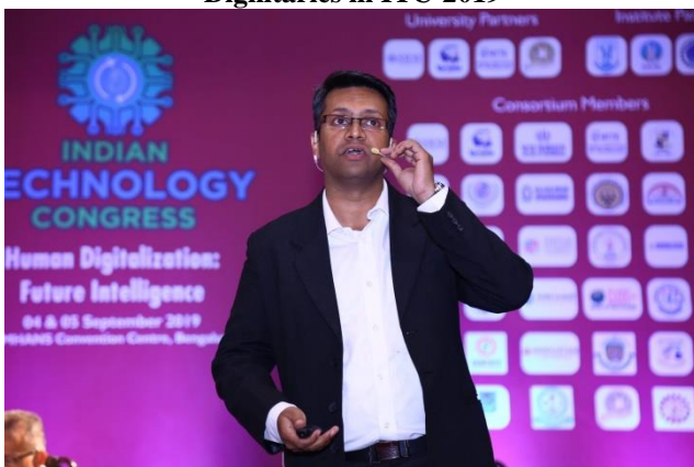
Speaker delivering his talk