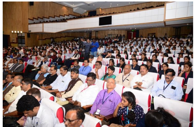
Audience present in ITC-2019