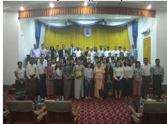
Young/woman engineers & Students at WFEO-CIC International Seminar at Yangon, Myanmar