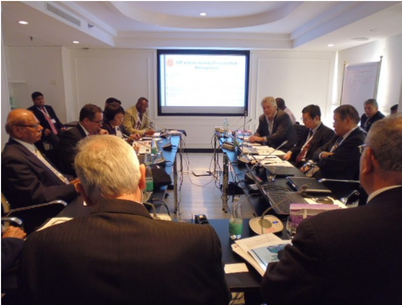
A photo of the serious discussion during the face-to-face meeting