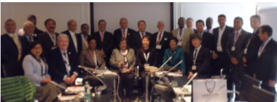
A photo of the participants together after the meeting