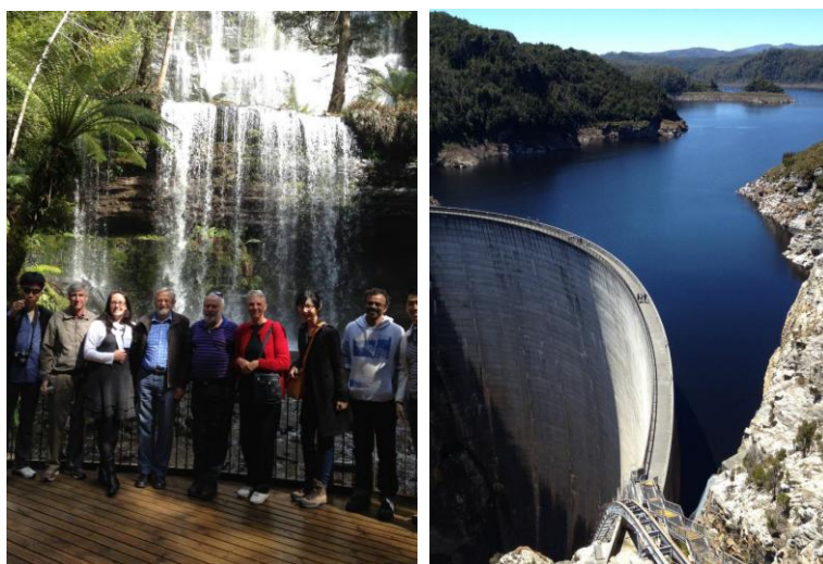
Conference delegates at Gordon Dam, Tasmania