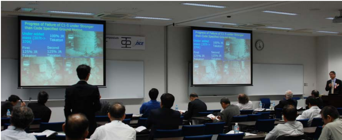
The participation situation of Symposium (a part of symposium hall)