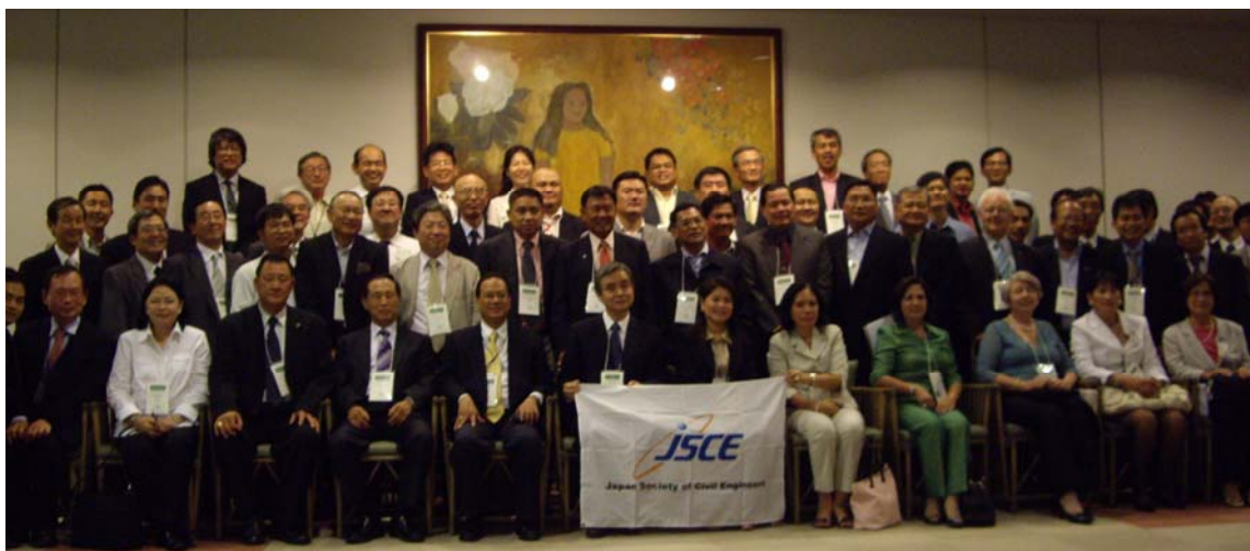
The participants of the International Program

The participants were Presidents of WFEO, JSCE, Korean Society of Civil Engineers (KSCE), National President of Philippine Institute of Civil Engineers (PICE) and delegates from Chinese Institute of Civil and Hydraulic Engineering (CICHE) and JSCE Chapters in Indonesia, Korea and Mongolia etc.